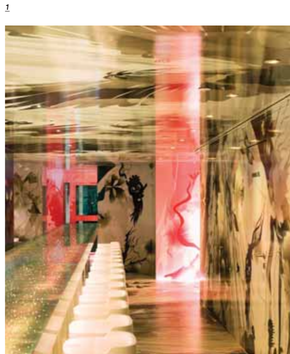
1-4: Cristal Bar 水晶吧

“夢幻、未來、童話般是Katrin室內設計作品的特質，這些特質和生她養她的祖國有著不可分割的聯繫。”