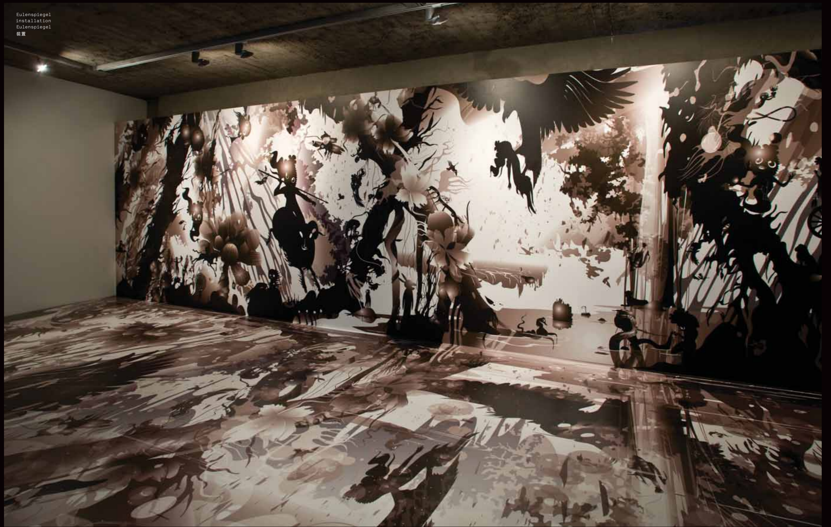
Eulenspiegel installation Eulenspiegel 装置